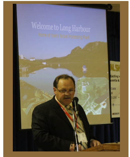
LHDC Chairman addresses delegates @ PBIS - 2012