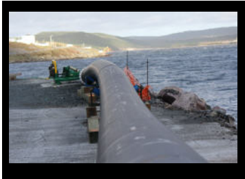
effluent pipe snakes its way into the waters of Long Harbour