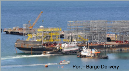
Port - Barge Delivery

economic development....(is about) jobs, income, and community prosperity - is a continuing challenge to modern society. To meet this challenge, economic developers must use imagination and common sense, coupled with the tools of public and private finance, politics, planning, micro and macroeconomics, engineering, and real estate.