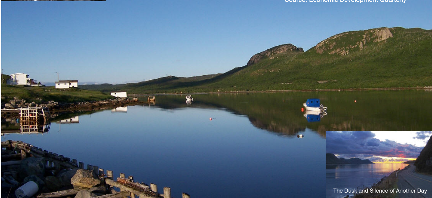
The Dusk and Silence of Another Day