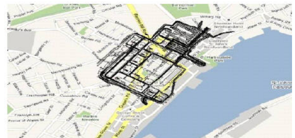
Main Processing Plant Superimposed over downtown St. John's

Upcoming Construction Activities at the Long Harbour site will include continuing mechanical, piping, electrical and instrumentation work. The remaining earthworks and overland piping are also to be completed. The $2.8 billion project is scheduled to begin operations in 2013.