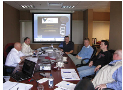
LHDC Board meets with Vale officials at AGM